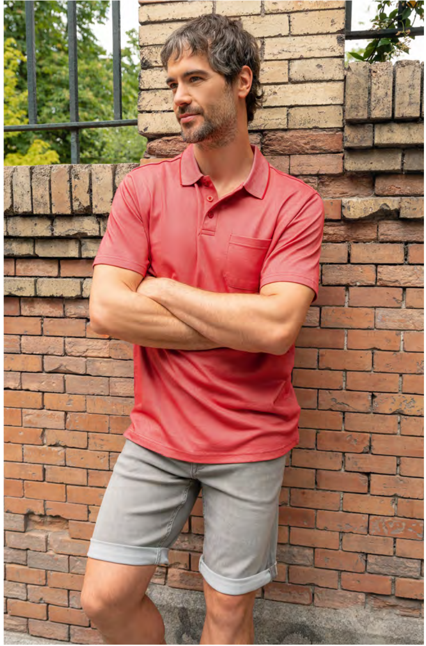
POLO SHIRT . 321153 X5 / JEANS . 345037 X5