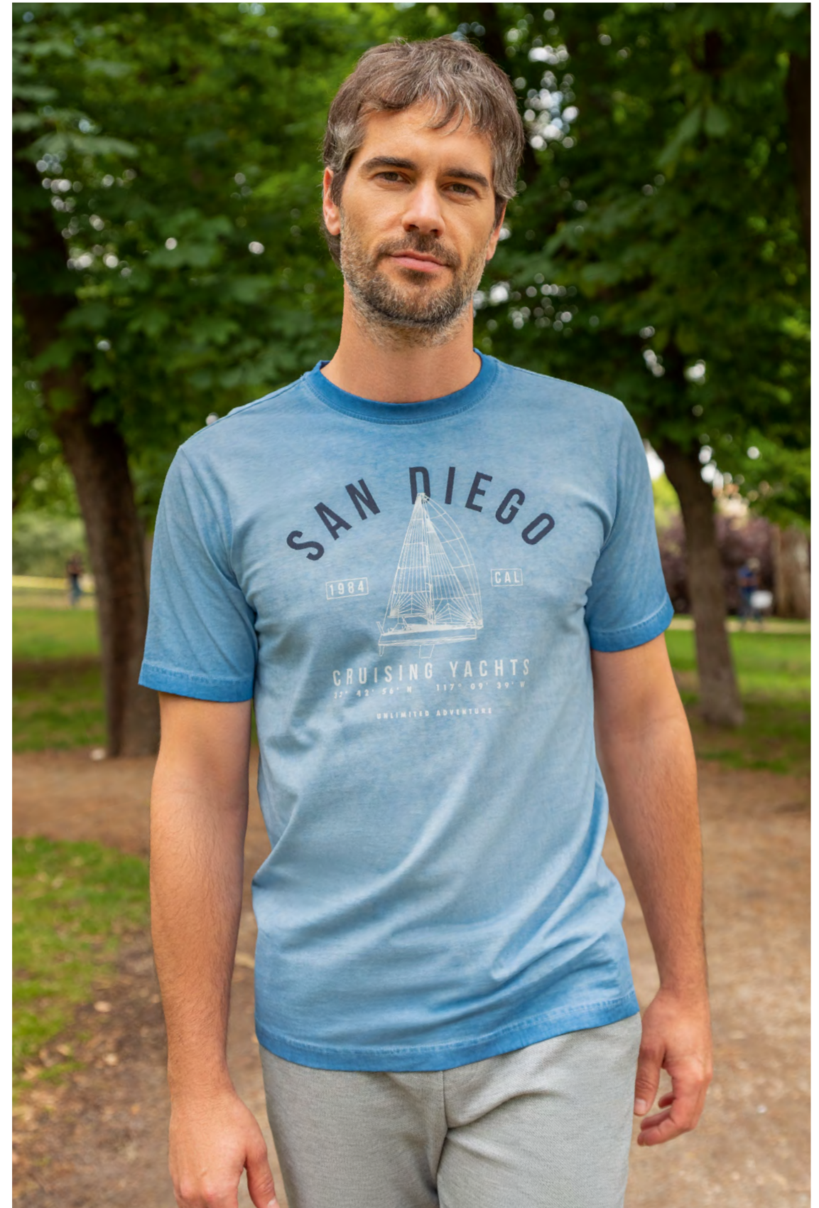
T-SHIRT . 302802 X / SHORTS . 343561 X5