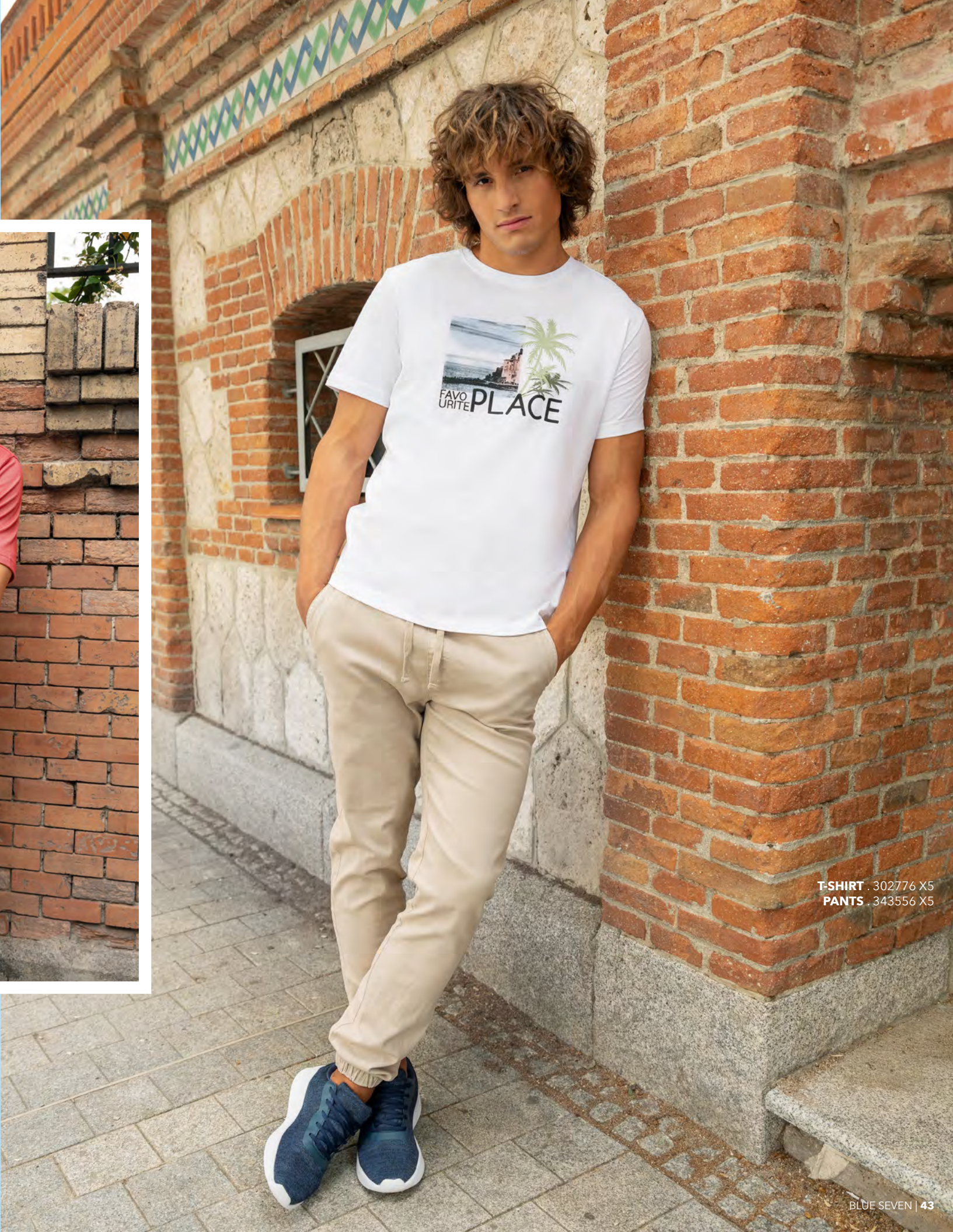
T-SHIRT . 302776 X5 PANTS . 343556 X5