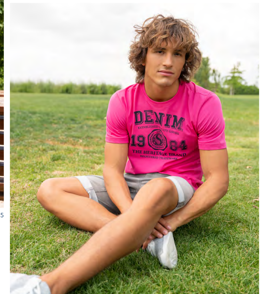
T-SHIRT . 302772 X5 / JEANS . 345037 X5