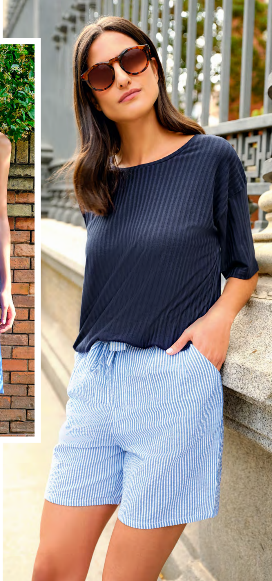
T-SHIRT . 105772 X5 / SHORTS . 186166 X