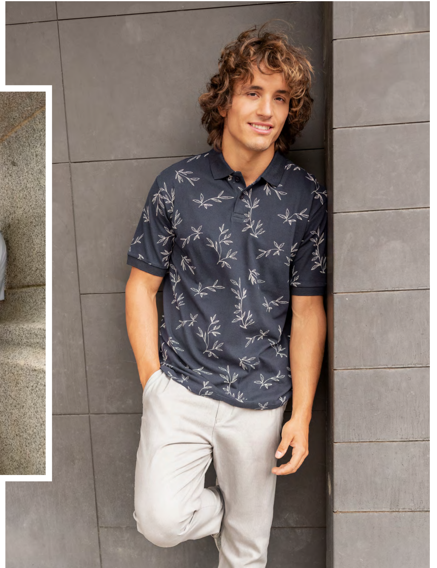
POLO SHIRT . 321165 X5 / PANTS . 343558 X5