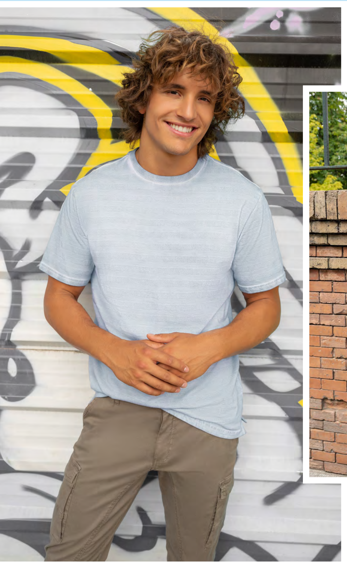
T-SHIRT . 302782 X5 / PANTS . 343554 X5