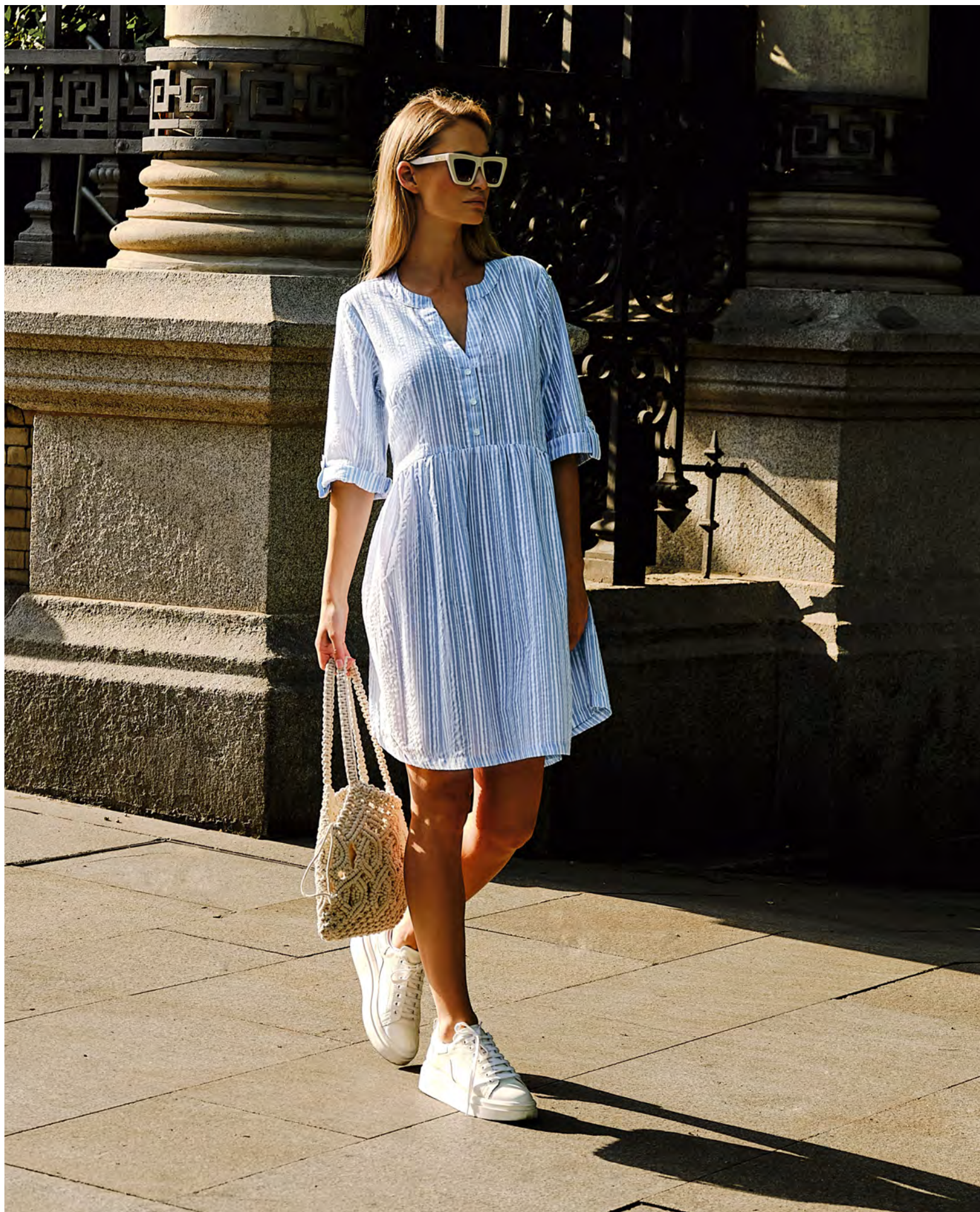
DRESS . 184145 X