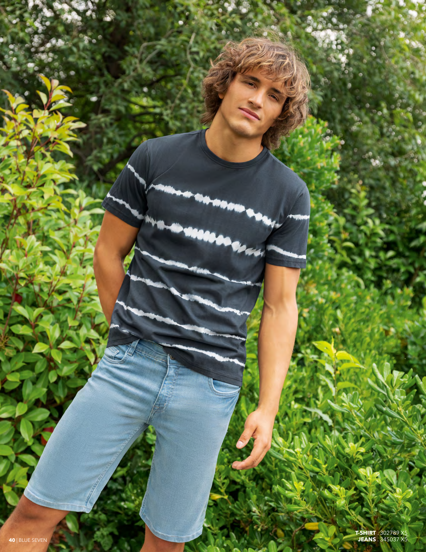
T-SHIRT . 302789 X5 JEANS . 345037 X5