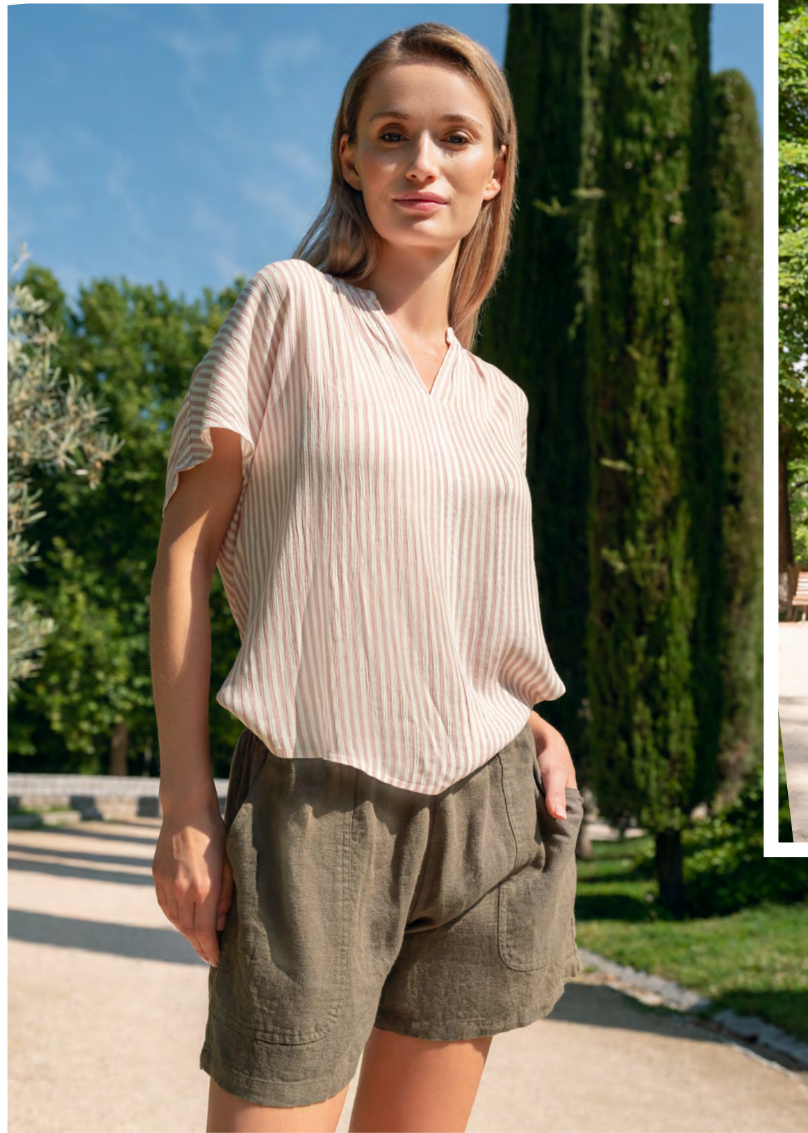
BLOUSE . 180224 X / SHORTS . 186171 X5