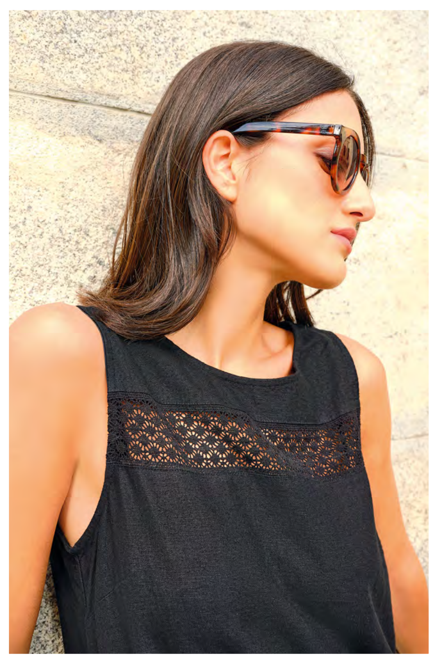
DRESS . 184150 X5