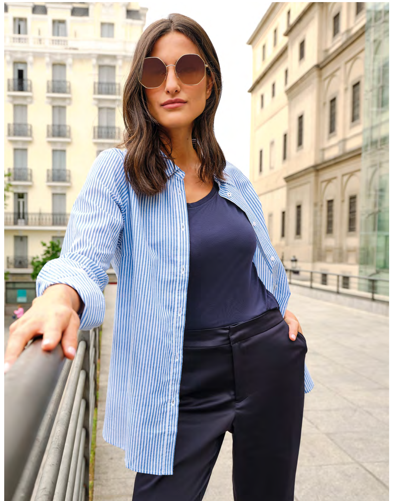
BLOUSE . 180203 X5 / PANTS . 186153 X5