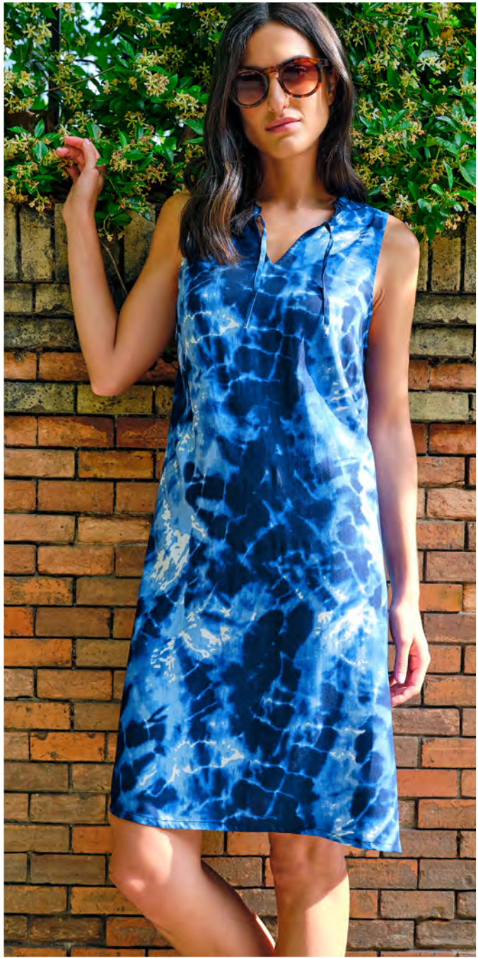
DRESS . 184154 X