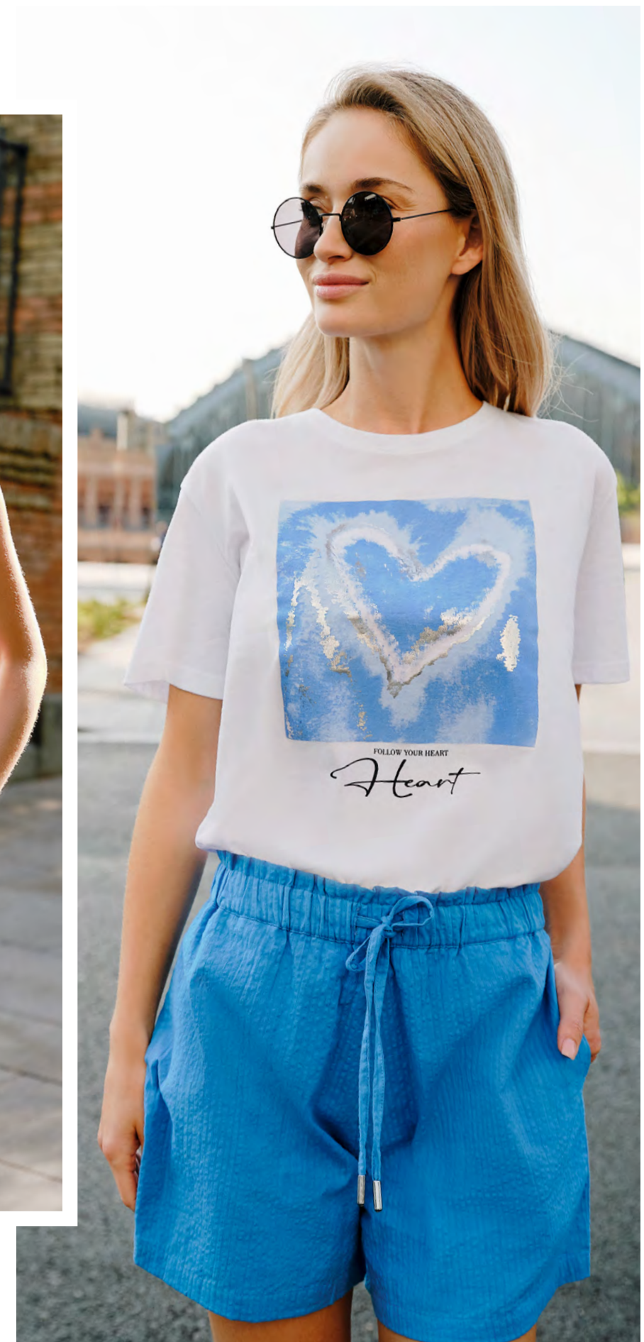
T-SHIRT . 105777 X5 / SHORTS . 186159 X5