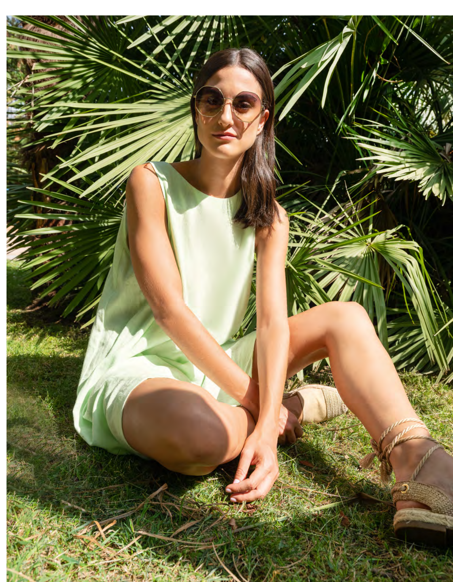
DRESS . 184151 X5