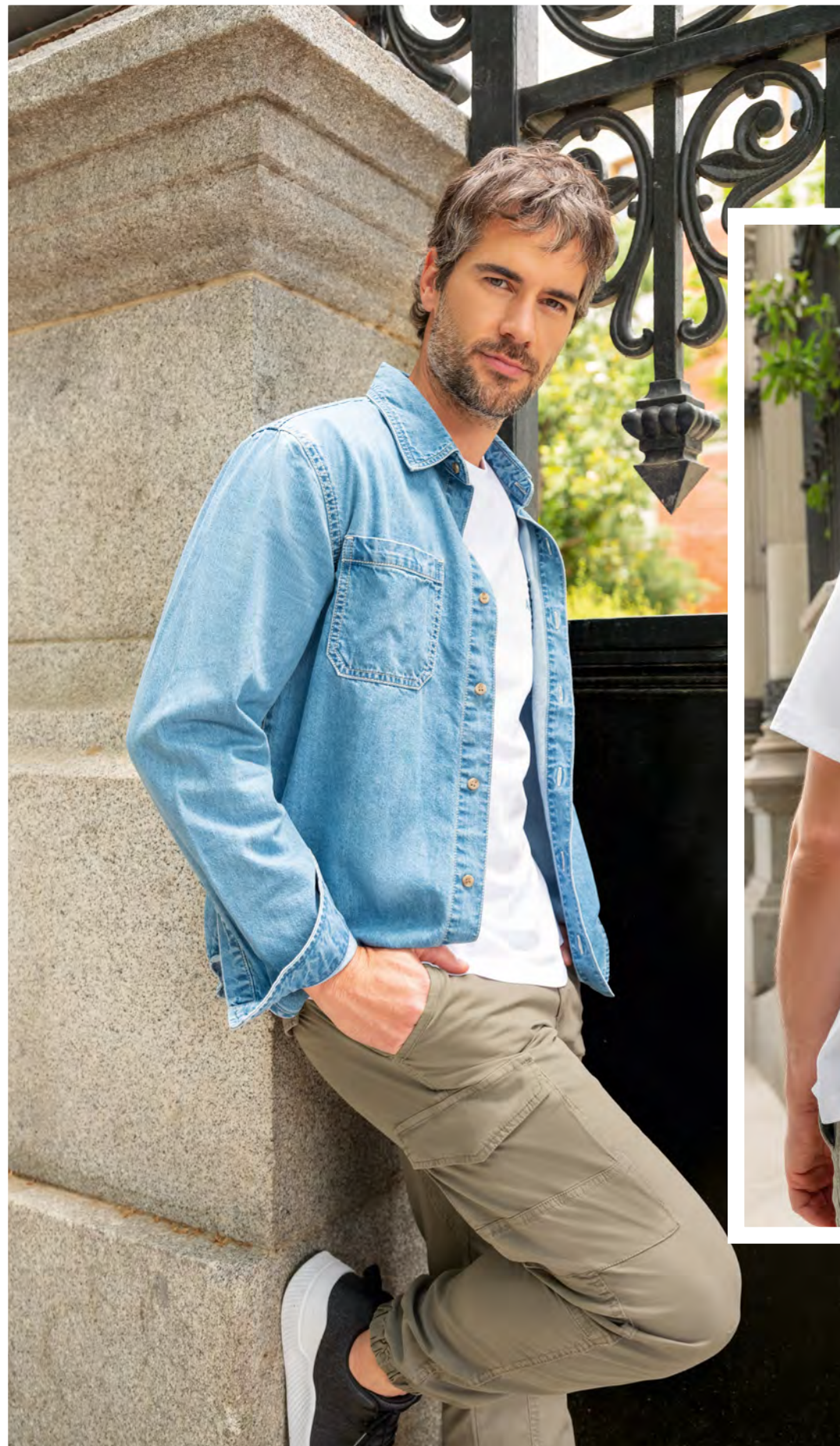
WOVEN SHIRT . 341007 X5 / T-SHIRT . 302793 X5 / PANTS . 343554 X5