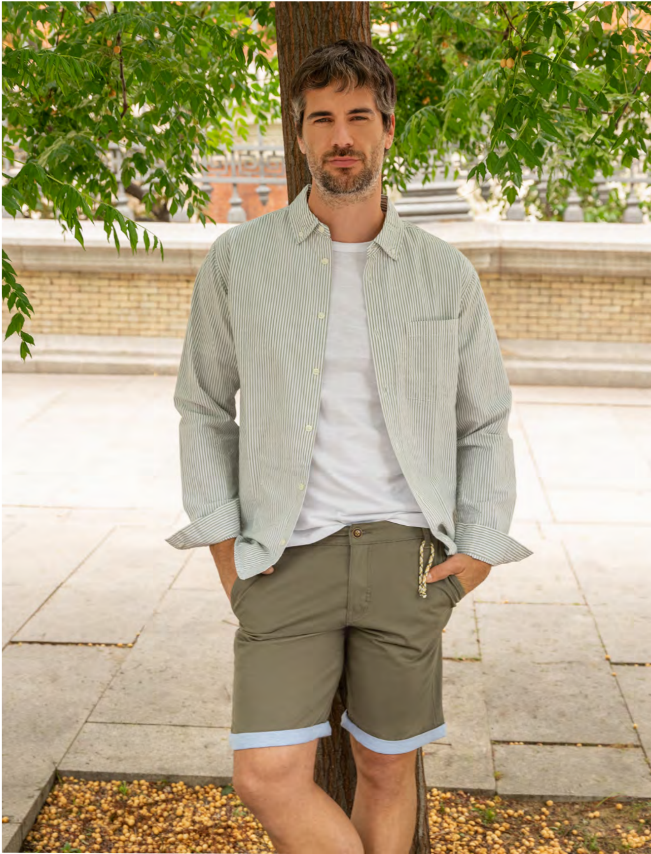
WOVEN SHIRT . 341009 X5 / T-SHIRT . 302774 X5 / SHORTS . 343555 X5