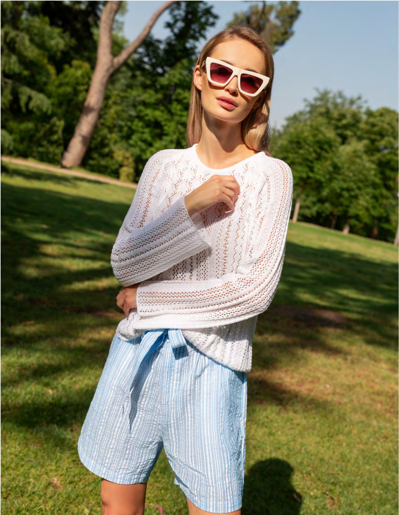
PULLOVER . 147158 X5 / SHORTS . 186161 X