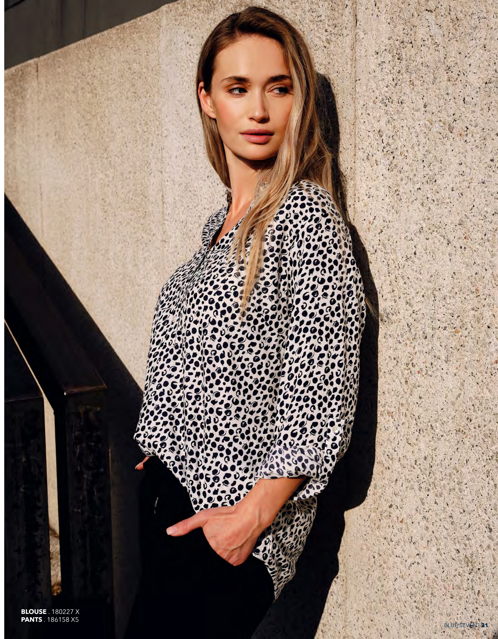
BLOUSE . 180227 X PANTS . 186158 X5