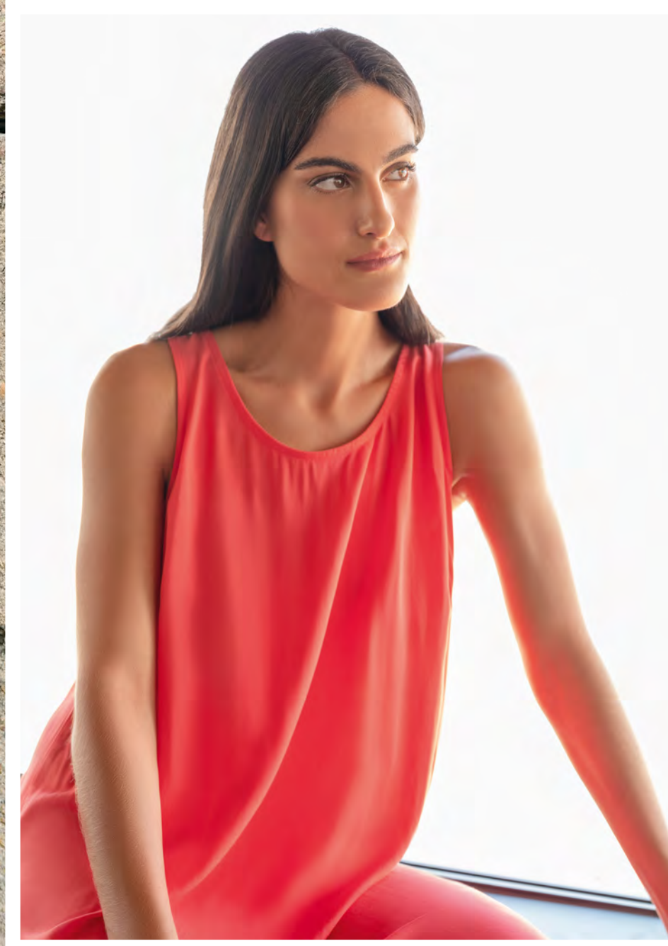
DRESS . 184166 X5