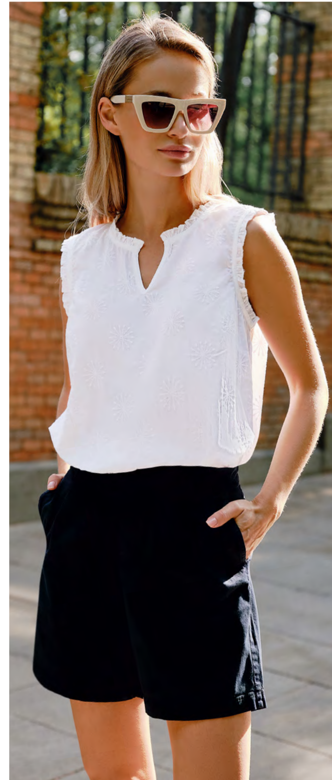
BLOUSE . 180208 X / SHORTS . 186168 X5