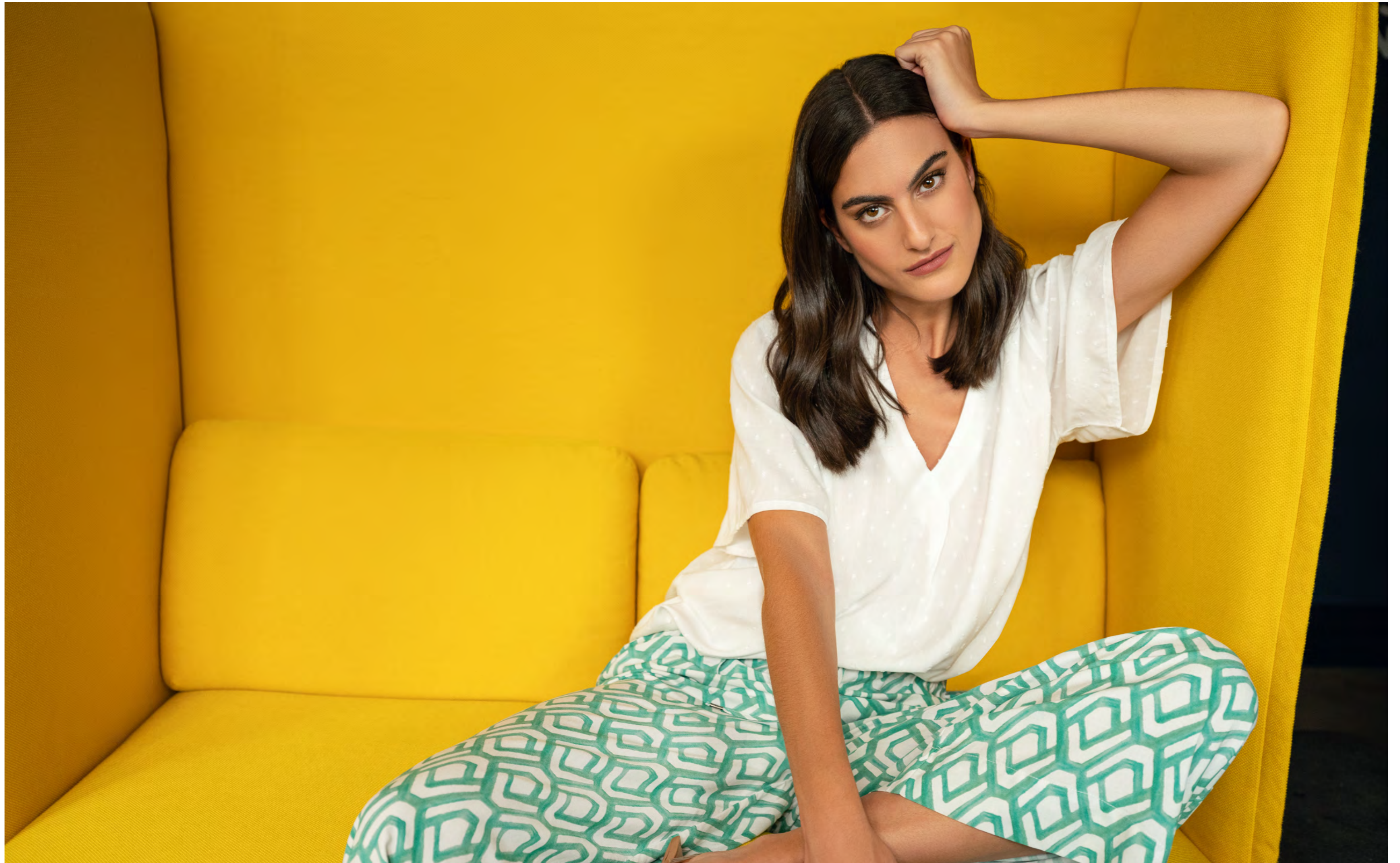
BLOUSE . 180207 X5 / PANTS . 186169 X