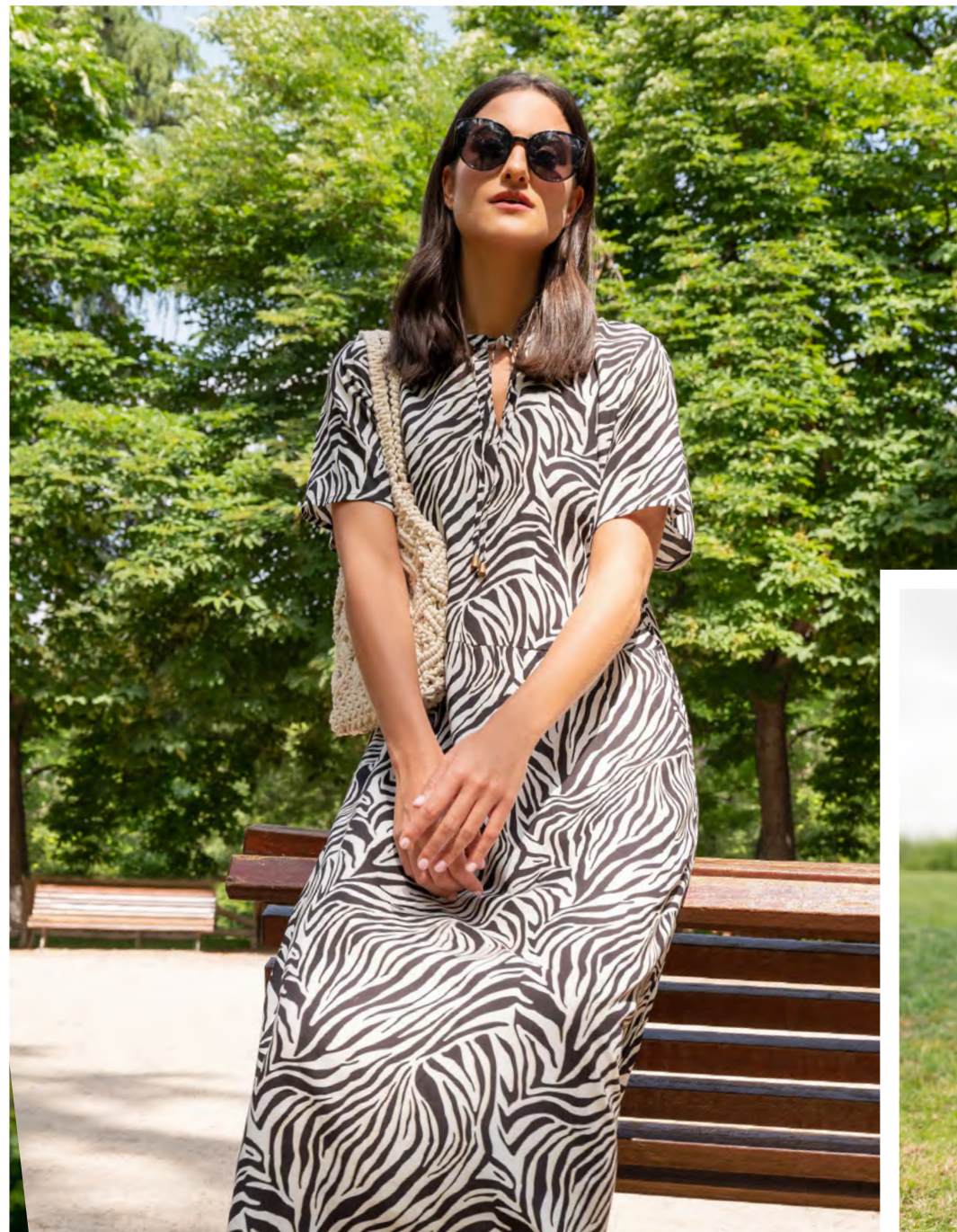
DRESS . 184138 X5