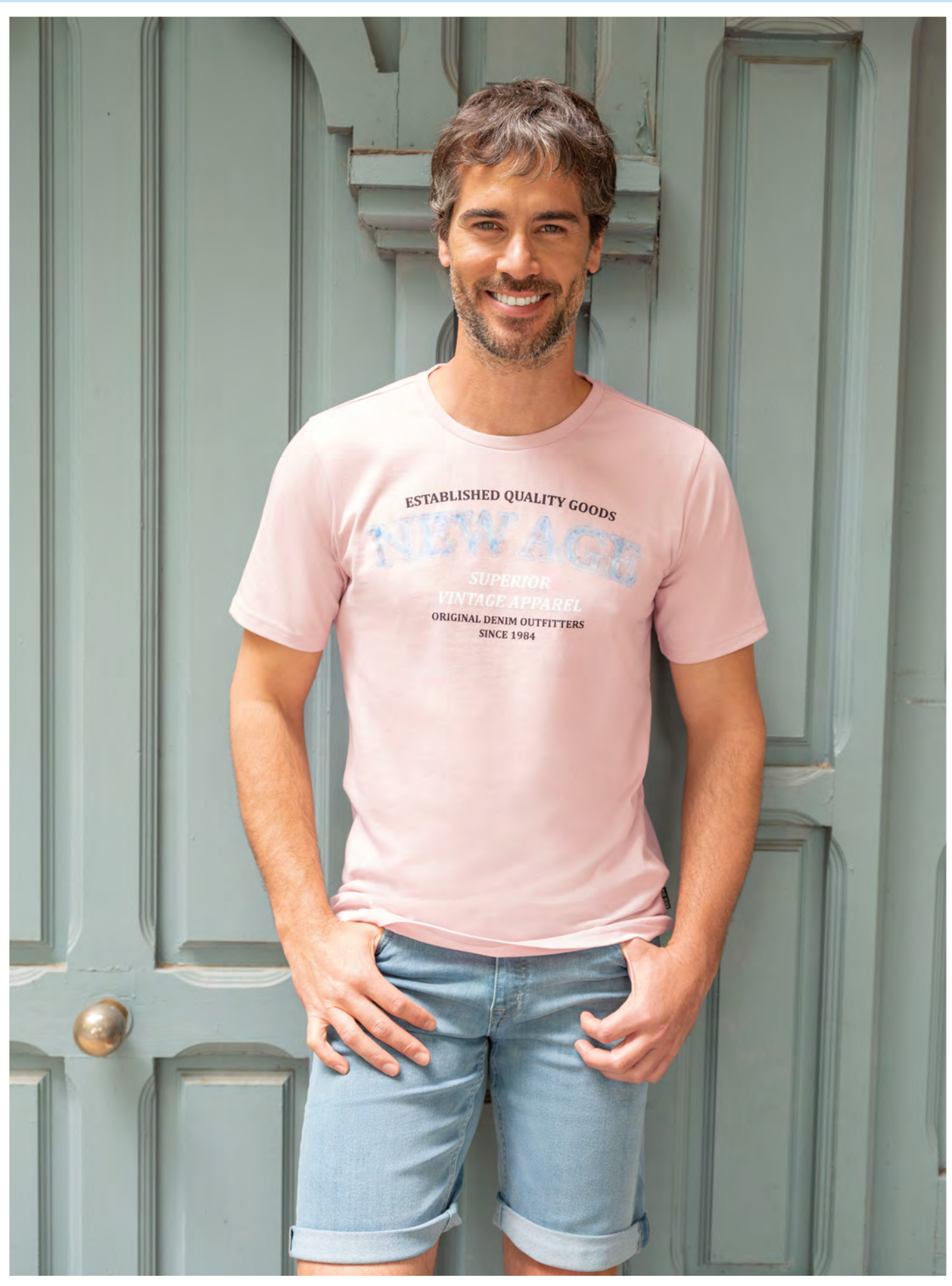
T-SHIRT . 302792 X5 / JEANS . 345037 X5