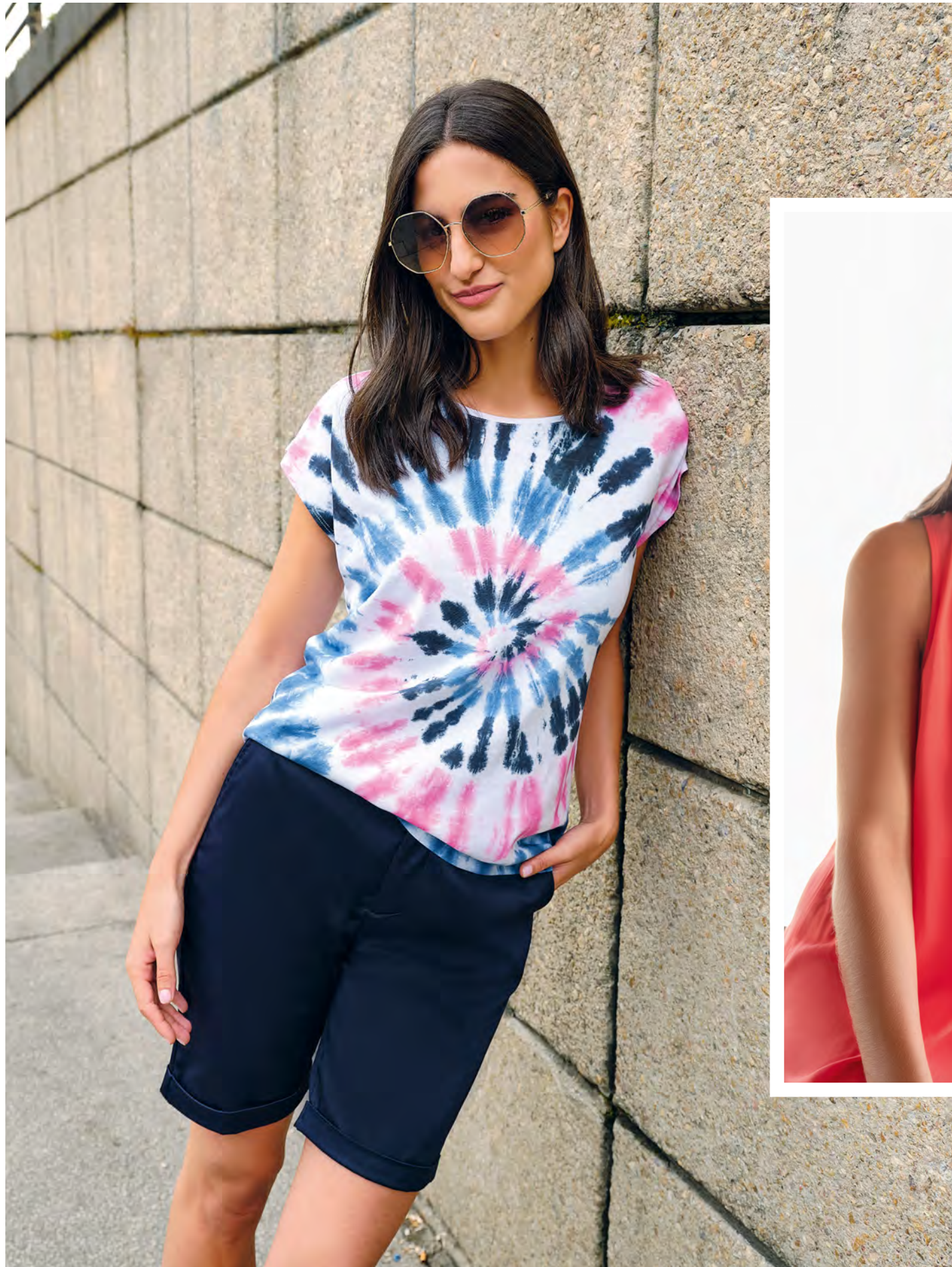
T-SHIRT . 105751 X / SHORTS . 186154 X5