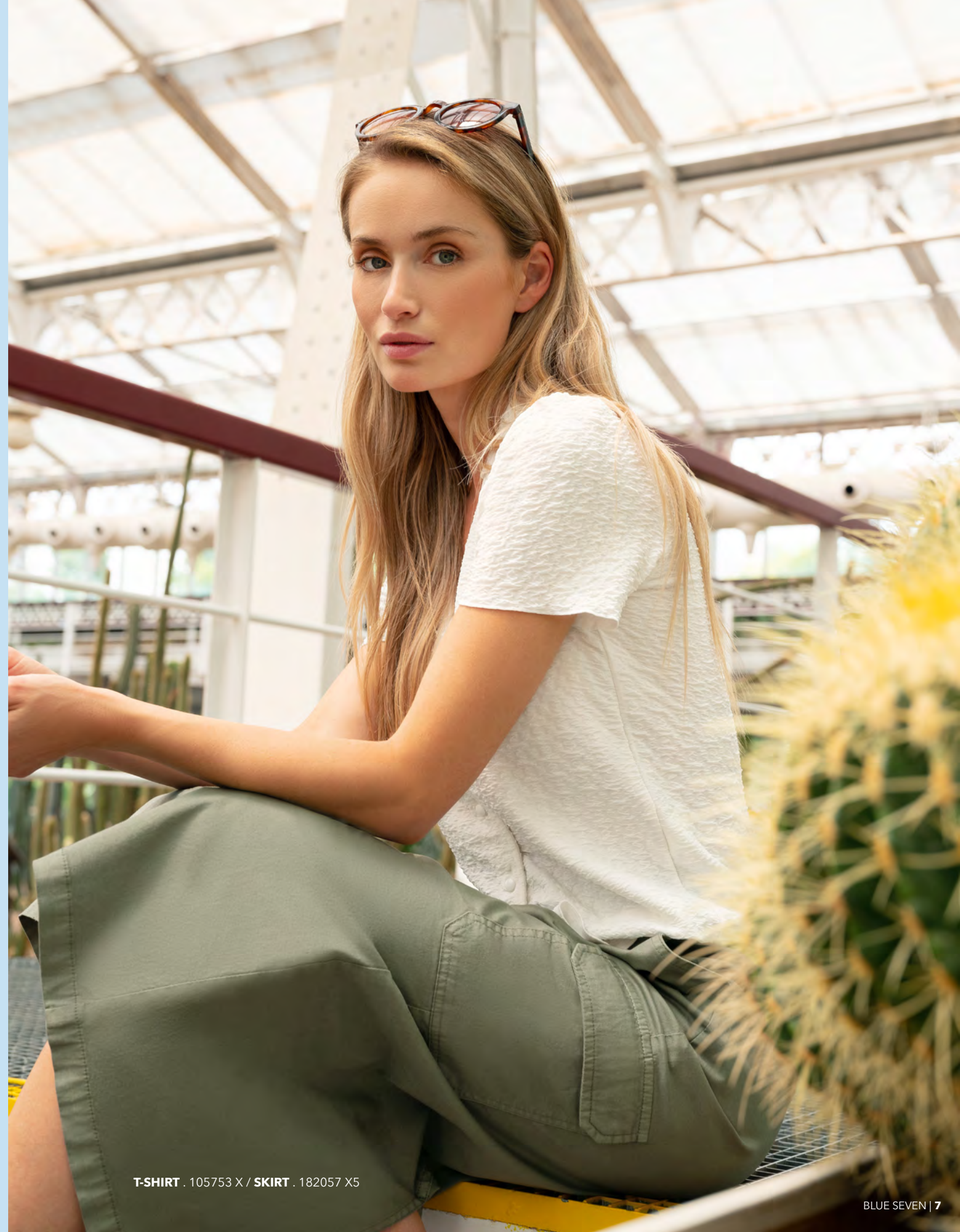
T-SHIRT . 105753 X / SKIRT . 182057 X5