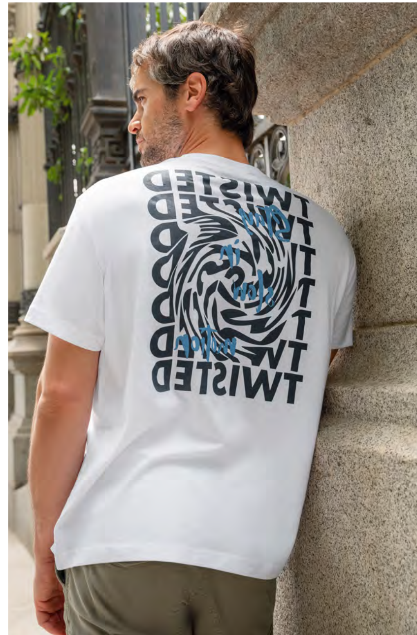
T-SHIRT . 302793 X5 / PANTS . 343554 X5